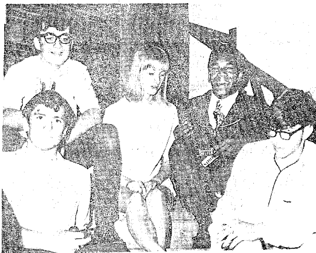
ON A HUMID night some coffeehouse patrons may move to an outside staircase to shoot the breeze — and catch a little, too.

The church also sponsors dances, open to area teens, during the fall.